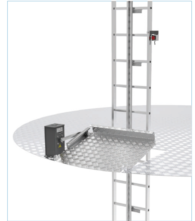
IHA-15 Back-Opening Model