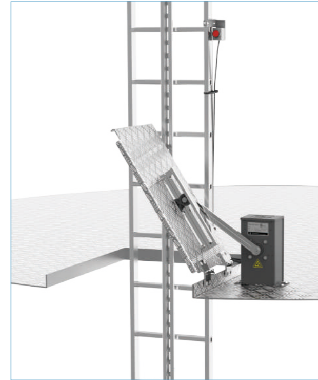
IHM-15 Side-Opening Model